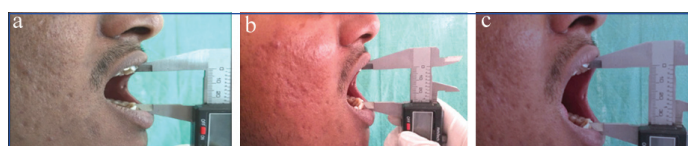
[Table/Fig-3]: Pre, mid and post-treatment change in Mean Mouth Opening (MMO). a) Pre-treatment pain free mouth opening. b. Mid treatment pain free mouth opening. c. Post-treatment pain free mouth opening.